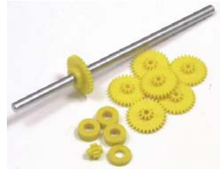
23480 Spare Gears Kit