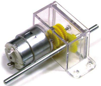
23482 ClearBox Motor